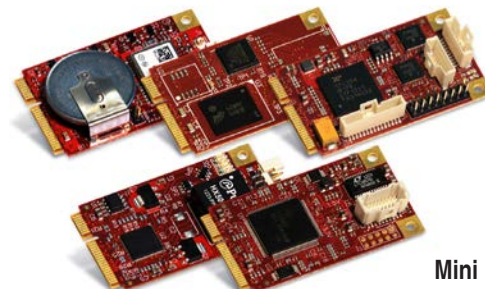
Mini PCIe Modules